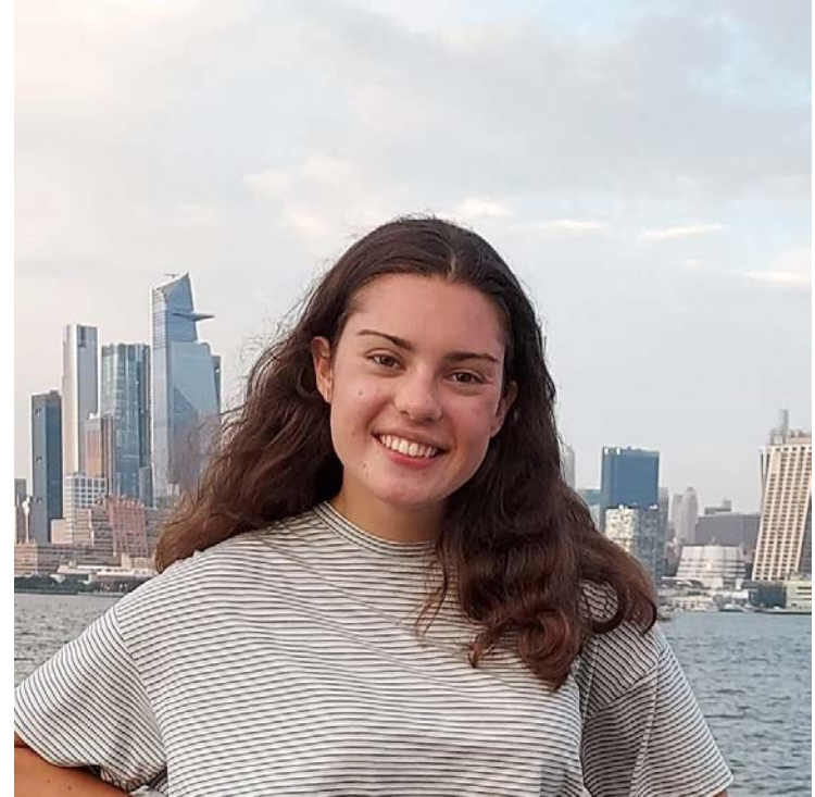
a short description of the image above